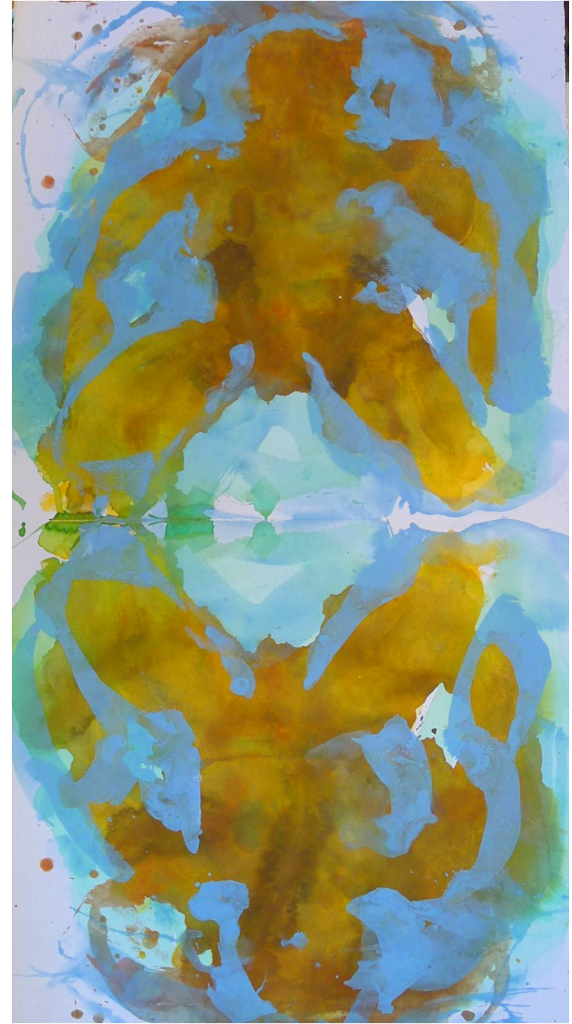
GERRY GENDER #12 2012 GOUACHE ON PAPER 50 ½ X 26 IN. (128 X 66 CM)