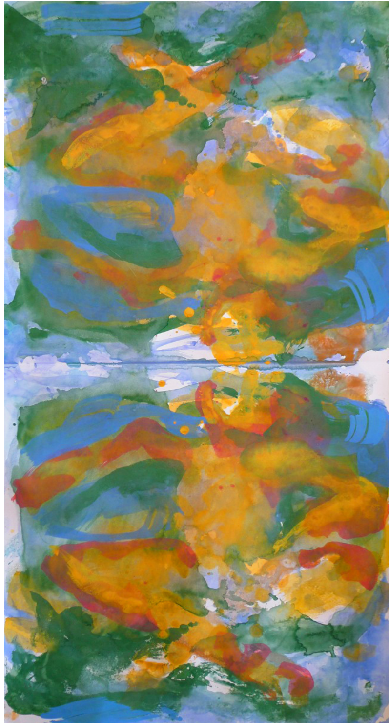
GERRY GENDER #11 2012 GOUACHE ON PAPER 50 ½ X 25 ½ IN. (128 X 65 CM)