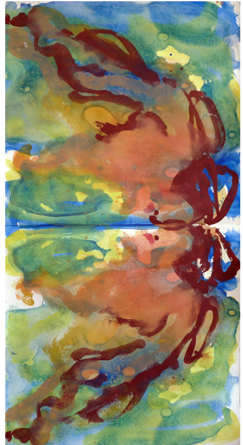
GERRY GENDER #10 2012 GOUACHE ON PAPER 50 1/2 X 24 1/2 IN. (128 X 62 CM)