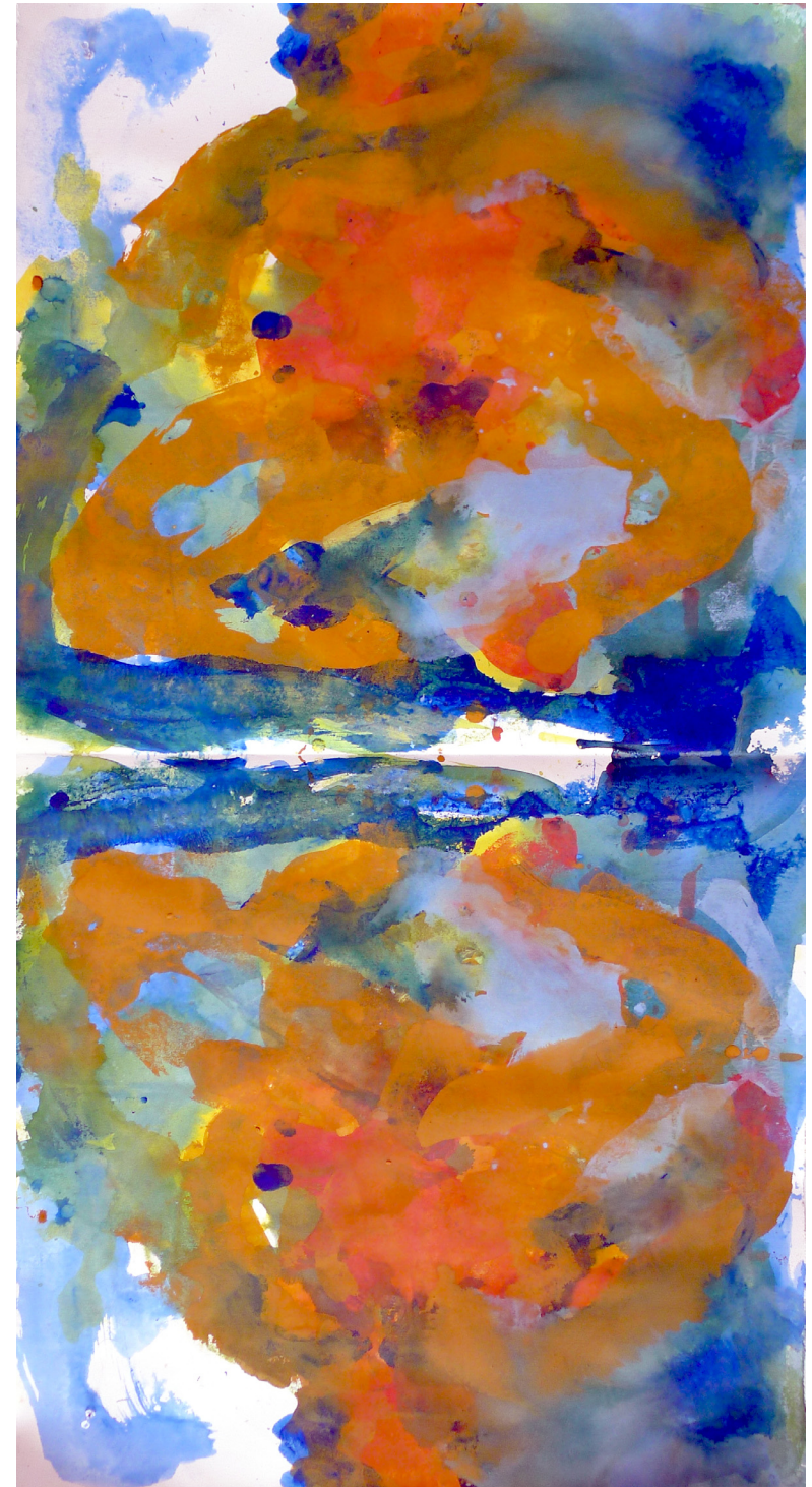
GERRY GENDER #8 2012 GOUACHE ON PAPER 50 X 26 IN. (127 X 66 CM)