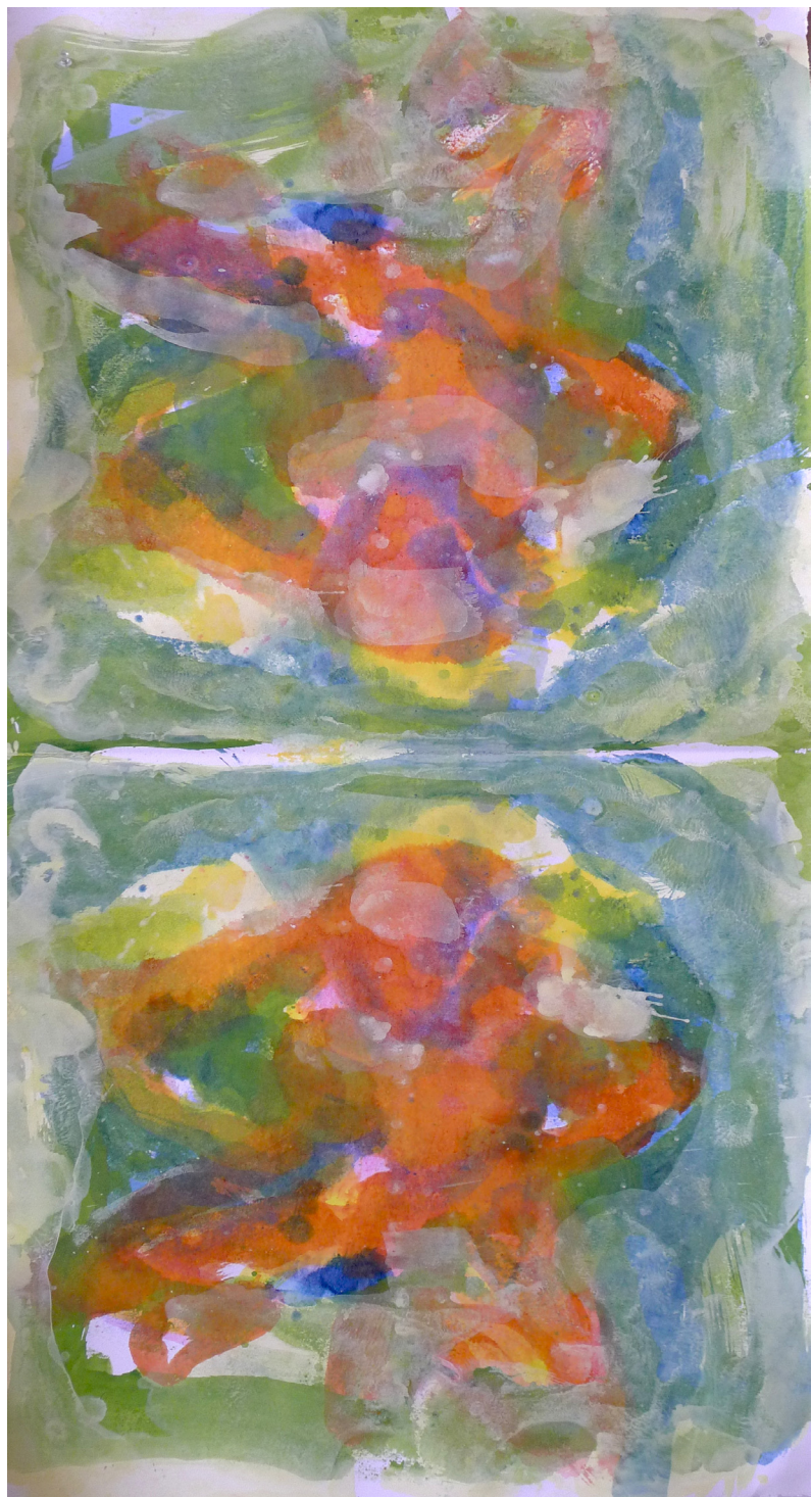
GERRY GENDER #5 2012 GOUACHE ON PAPER 50 X 24 IN. (127 X 61 CM)