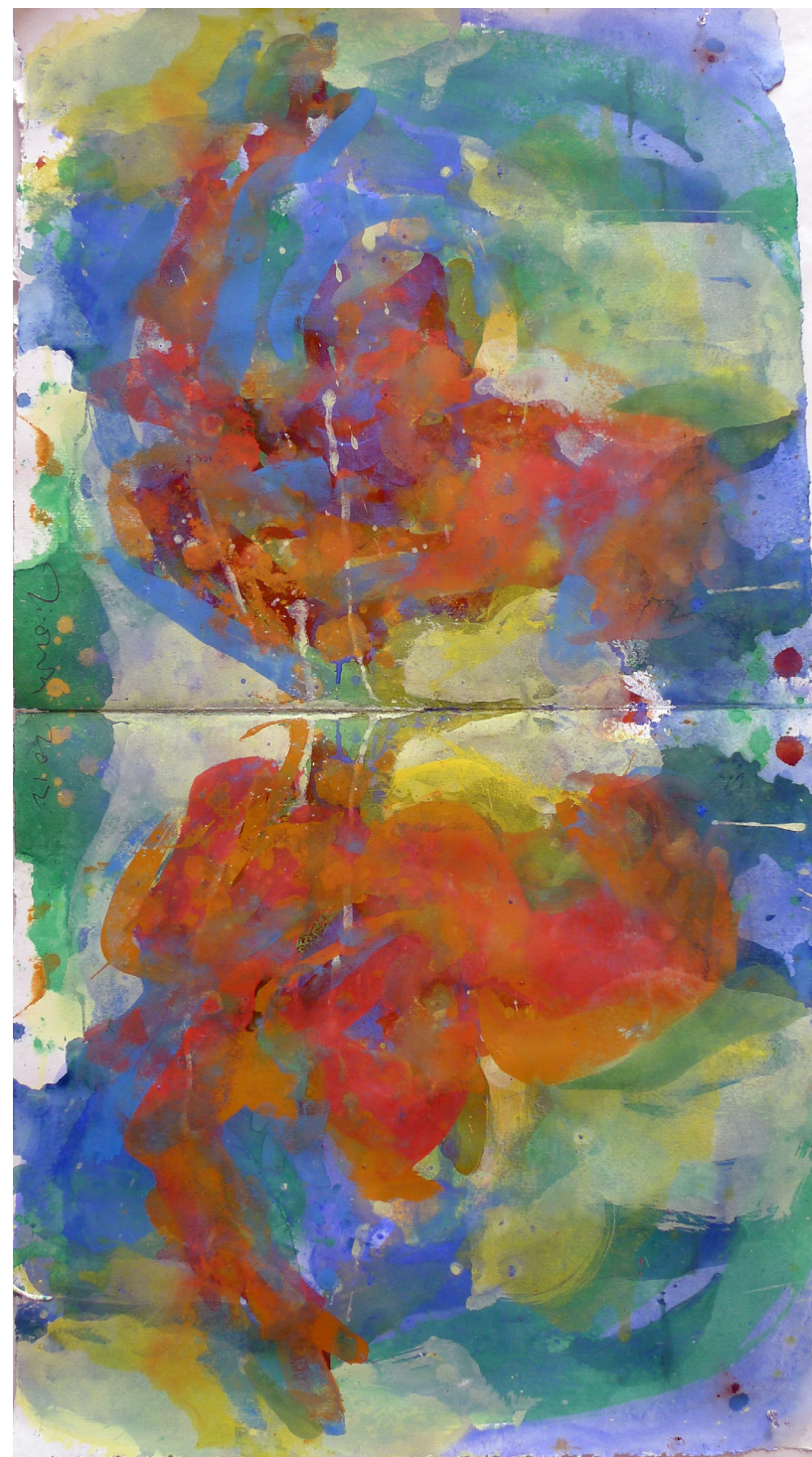
GERRY GENDER #6 2012 GOUACHE ON PAPER 50 X 27 IN. (127 X 68 CM)