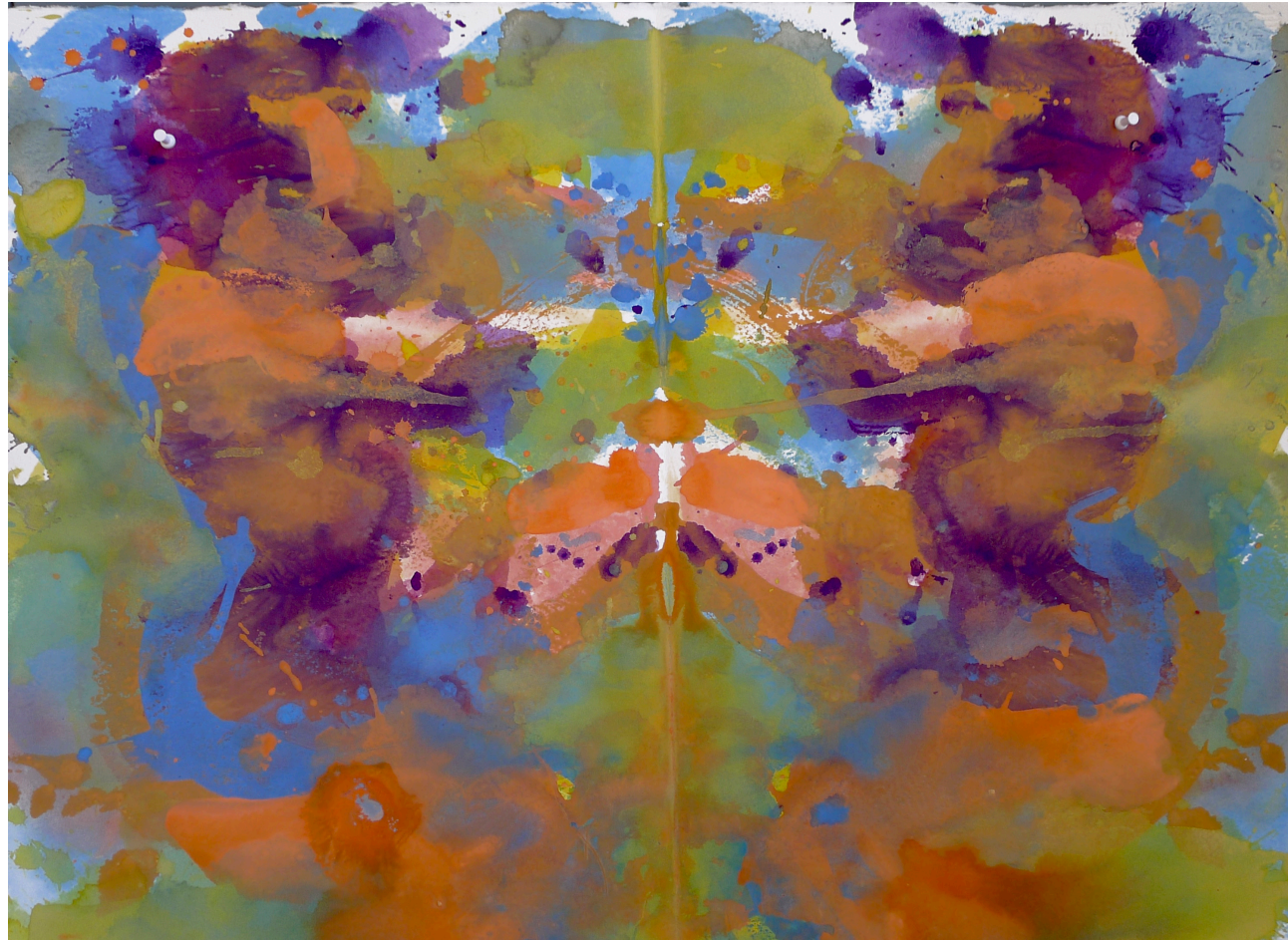
GERRY GENDER #9 2012 GOUACHE ON PAPER 22 1/2 X 29 1/2 IN. (57 X 75 CM)