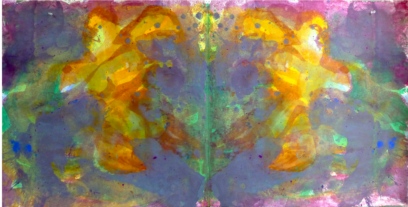
GERRY GENDER #7 2012 GOUACHE ON PAPER 25 X 50 IN. (63.5 X 127 CM)