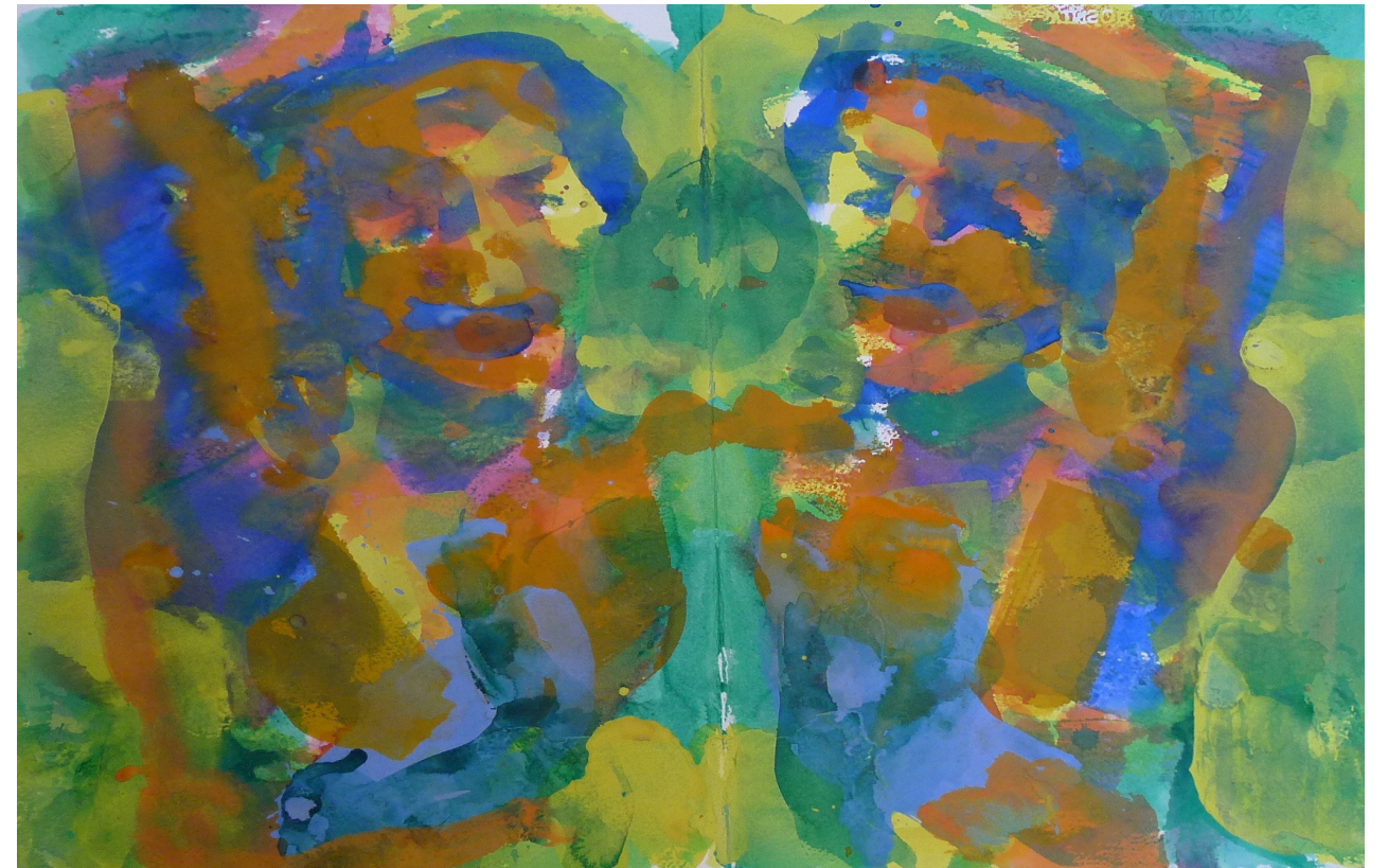
GERRY GENDER #4 2012 GOUACHE ON PAPER 22 ½ X 29 ½ IN. (57 X 75 CM)