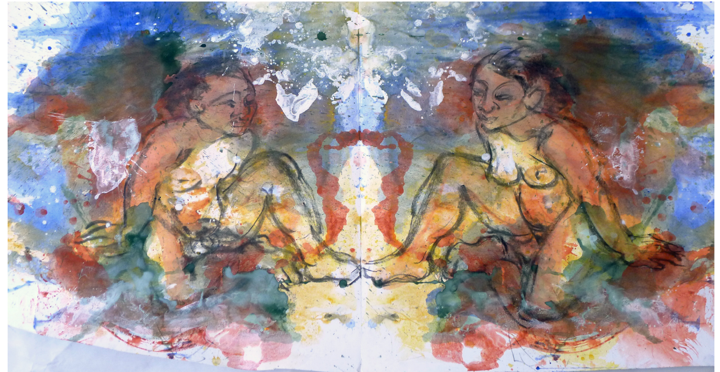
GERRY GENDER #1 2012 GOUACHE AND CHARCOAL ON PAPER 27 X 50 1/2 IN. (68 X 128 CM)