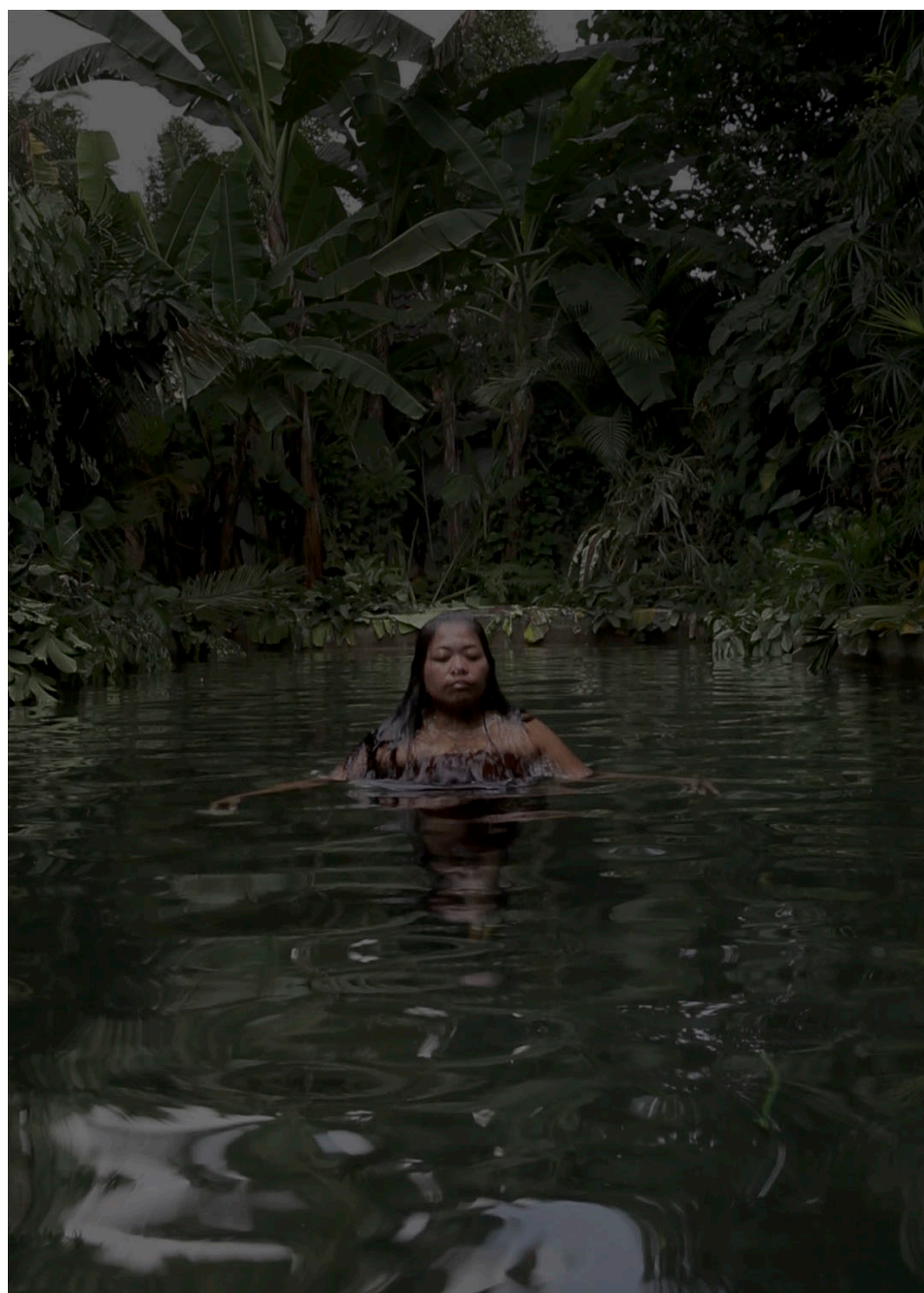
IIN IIN KUNGKUM 2012 GICLEE DIGITAL PRINT 18 X 12 ¼ IN. (46 X 31 CM)

PUBLISHED ON THE OCCASION OF THE EXHIBITION