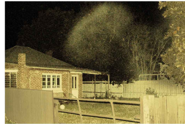
Night Spirits No. 7 , 2013, photographs mounted behind acrylic, 10 x 59 in (26 x 150 cm)

Spirit Landscapes is a major new body of work from Tracey Moffatt, comprising six distinct components: five different photographic series and a moving image piece. It represents the artist's return to highly personal themes relating to family, home, and the land, specifically within the context of her Australian Aboriginal heritage. A key concept is the notion of a "return to country," a seeking out of one's ancestral lands and an attempt to reconnect with history and tradition. After many years living abroad, Moffatt began a three year exploration of places in her native Australia that were scenes of important events in her own life and that of her family. The resulting body of work, her first since the Plantation series of 2009, reflects on the way her personal story is intertwined with the often tragic history of race relations in Australia. Yet, as Moffatt points out, it can also be "opened up" and read as a universal meditation on the significance of land and place.