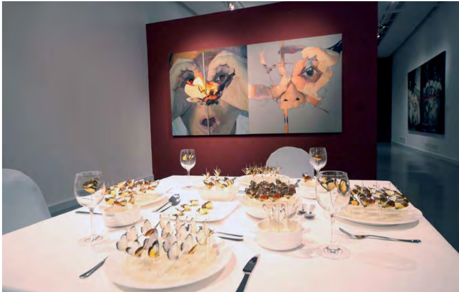
Kuteropong (Watching The Wound) , 2007, diptych, acrylic on canvas, 180 x 180 cm each, private collection.

Its display notwithstanding, 'Testimonies' packs a powerful visual punch. Boasting three of Harsono's most visionary installations of the nineties, as well as two forward-looking pieces of the mid seventies that are extraordinary in their art historical implications, the show assembles work offering rich opportunities for critical study. The 1993-1994 Voice Without Voice/ Sign , borrowed from the Fukuoka Asian Art Museum, is still today a beacon of contemporary Southeast Asian art. The mixed graphic and 3-D installation, propped casually on the floor against a gallery wall as it was 16 years ago when first made, like all major works of art, remains a formal and conceptual masterpiece however removed from the historical context of its early-1990s theme. With its nine black and white silk-screen on canvas panels depicting a silent hand spelling out demokrasi in sign language, the installation's crisp power has as much to do with its formal command as its invocation of democracy, still a charged subject in Southeast Asia today. Indeed the piece, with its