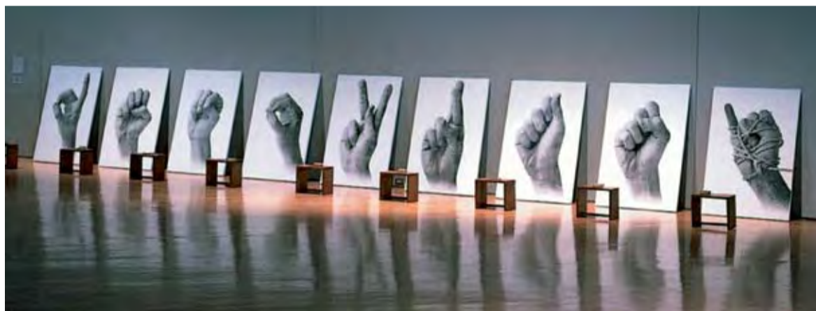
Voice Without Voice / Sign (1993-4), silkscreen on canvas (9 panels), wooden stools and stamps, 143.5 x 95.5 cm each panel, Fukuoka Asian Art Museum collection

pitch-perfect marriage of formal acumen, cerebral conceptualism, and universally engaging iconography in the form of the human hand, manages not only to physically recall the first stirrings of change in early 1990s Indonesia, but provoke the goose-bumps of potential empowerment in a new generation of reformers. And this even in the cautious setting of a national art museum!