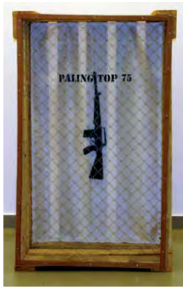
Paling Top '75 (The Most Top '75), 1975, plastic gun, textile, wooden crate, wire mesh, 50 x 100 x 157 cm. Artist collection

found in the first part of the show. Split into two distinct sections, the art is displayed chronologically, Harsono's socially vocal installations (1975-1998), on one side, and his 21st-century pieces (2002-2009), predominantly 2-D works on paper or canvas, on the other.