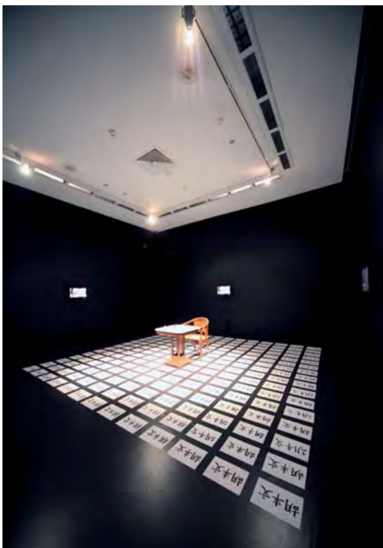
Rewriting The Erased (2009), installation and performance video, artist's collection