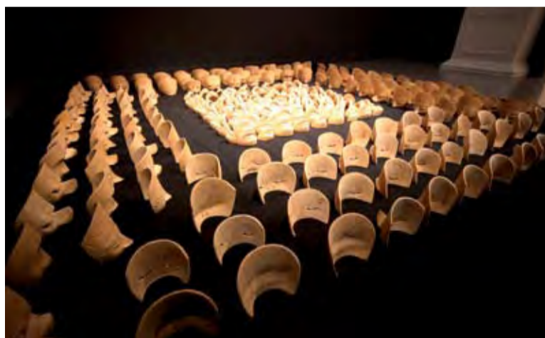
The Voices Controlled by the Powers (1994), installation with wooden masks and cloth, dimensions variable, artist's collection

Other historically relevant installations figuring in this part of the show are the 1994 The Voices Controlled by the Powers – larger in size than when presented in the 'Traditions/Tensions', the 1998 Burned Victims, Paling Top '75 , and Rantai yang Santai . Both from 1975, these two are amongst the most conceptually nuanced and formally refined works of the period, and having anticipated by nearly two decades the sophisticated Indonesian installation art of the 1990s, must be recognised as fundamental to the canon. Moreover, conceptualised in the mid 1970s when neither Western nor Japanese installation art was known in the archipelago, the two tantalisingly suggest specifically Indonesian roots rather than a derivative Western genesis. Finally, in addition to their art historical primacy, the two works' significance on a content level cannot be ignored, made as they were at the height of the New Order when any perceived criticism of the Suharto regime – and here the criticism was quite palpable – attracted harsh punishment.