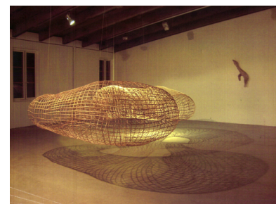
Cycle 2 , 2006, bamboo and rattan, courtesy the artist.

SP: We are all born into a certain condition. My experience was not all that terrible. Either that or I was so immune to everything around me. I actually value those