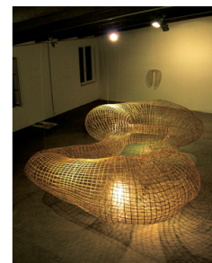
Cycle 2 , 2006, bamboo and rattan, courtesy the artist.