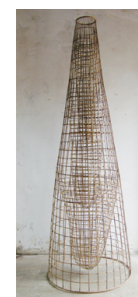
Upstream , 2005, bamboo and rattan, courtesy the artist.