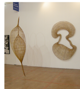
Duel , 2008, bamboo, rattan and wire, courtesy the artist.