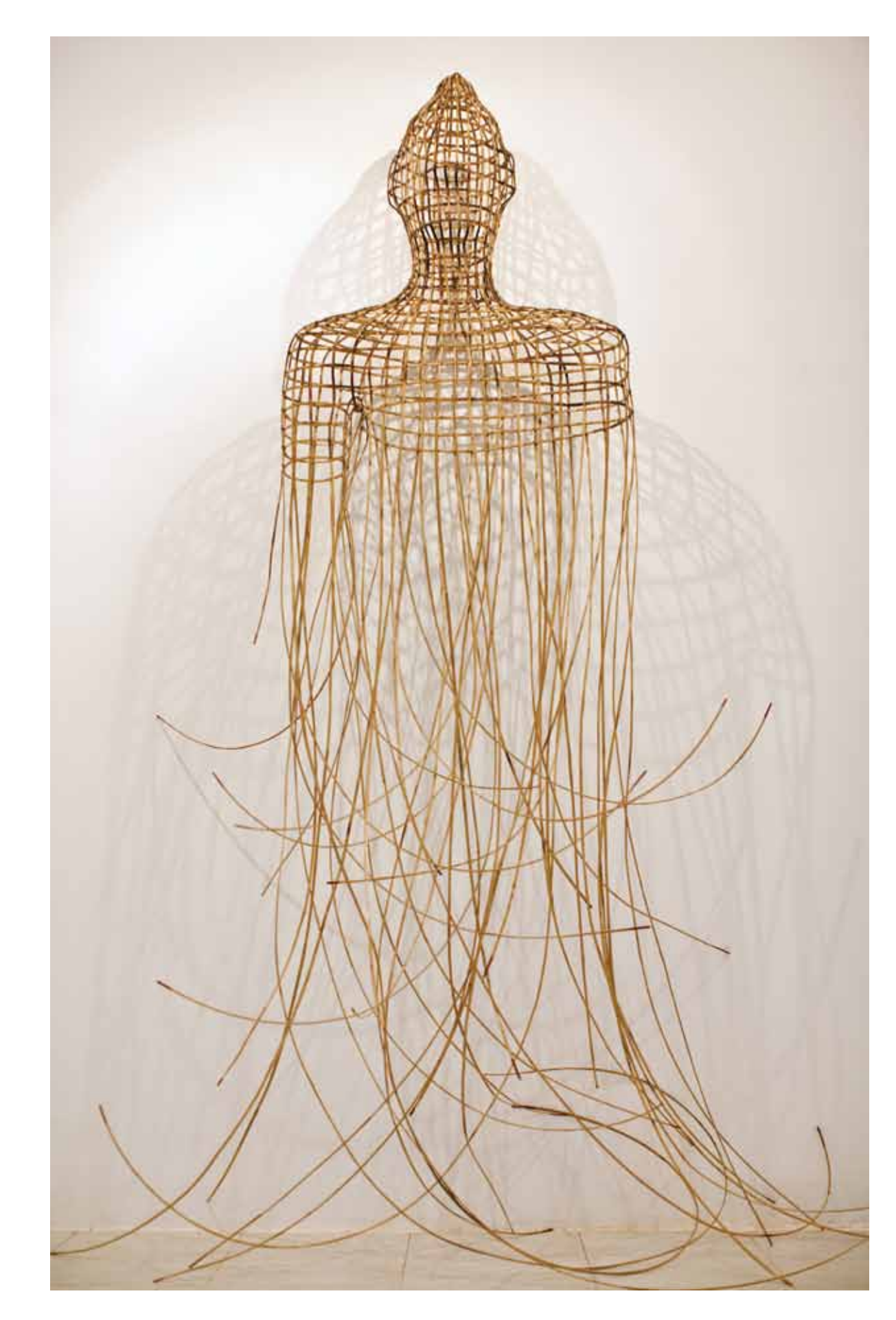
Buddha 2, 2009, by Sopheap Pich (Cambodian, born 1971). Rattan, wire, and dye. On loan from a private collection.

The work of Pinaree Sanpitak explores shifts and overlaps of meaning by incorporating forms that suggest various kinds of vessels—bodies, breasts, stupas, clouds. Historically these forms are associated with notions of generosity and plenty, presence and absence. But Pinaree leaves the meaning of her vessels unfixed, open to interpretive changes over time and