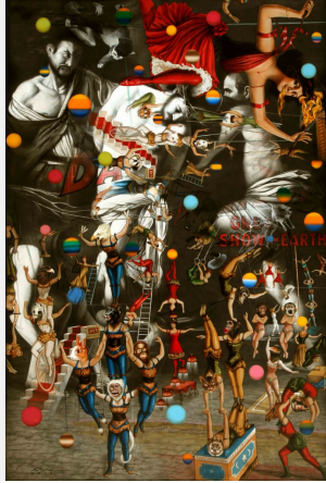
Ronald Ventura, 'Carne Carnivale', 2014, oil on canvas, 72 x 48 in.

In others, black and white figures resembling biblical saints mingle and merge with colourful, whimsical circus motifs. Such imagery is taken from vintage carnival posters and advertisements. The incongruity is jarring, eerie and disorienting: a nightmare in which a circus show breaks into a classical museum, wreaks havoc and makes statues come alive.