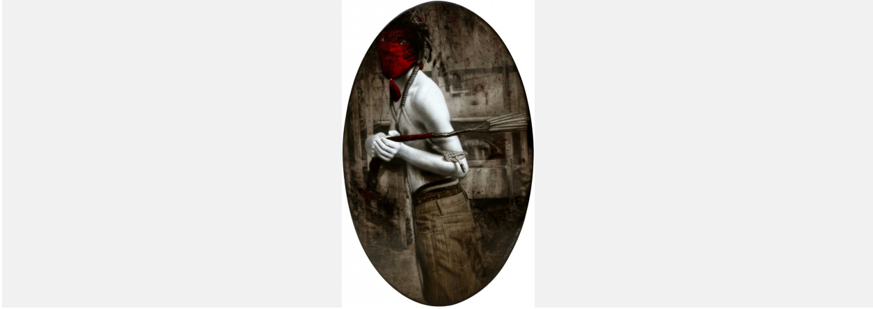
Ronald Ventura, 'Reflection Repetition', 2014, graphite and oil on canvas, 26 x 16 in.

The artist's sophisticated hyperrealism is combined with a greyscale palette stained with vivid, sinister reds. Poised as re-enactments of Christ's passion and crucifixion, the depicted activities are not officially sanctioned by the Roman Catholic Church.