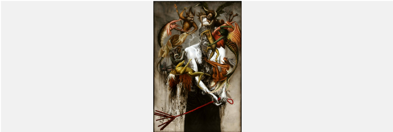
Ronald Ventura, 'Visiting Artist's Demons', 2014, graphite and oil on canvas, 72 x 48 in.

The artist's sophisticated hyperrealism is combined with a greyscale palette stained with vivid, sinister reds. Poised as re-enactments of Christ's passion and crucifixion, the depicted activities are not officially sanctioned by the Roman Catholic Church.